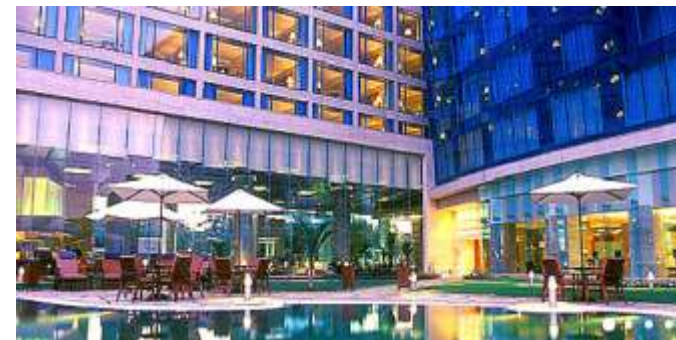
Hyatt Regency, Mumbai