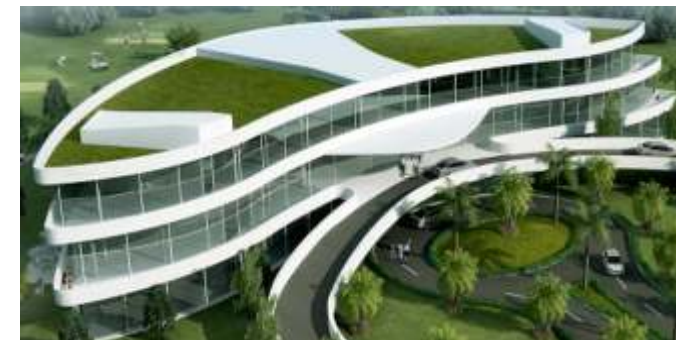
Jaypee Club House, Noida