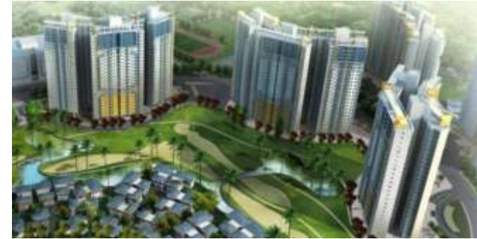
Blue Ridge Township, Pune