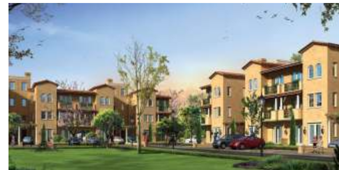
Emaar MGF Emerald Hills, Gurgaon