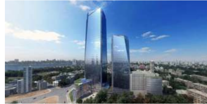
Kohinoor Square, Mumbai

FAIRWOOD, established in 1991, is an infrastructure consultancy company providing end-to-end services for the development of modern urban infrastructure. The gamut of Fairwood's services ranges from Pre-Design Studies & Design Services to Project Management Consultancy having over 20 years of experience in offering consultancy in various sectors including Tourism, Township Planning, SEZs, Retail Complexes, Offices, Leisure & Theme Parks, and Convention Centers.